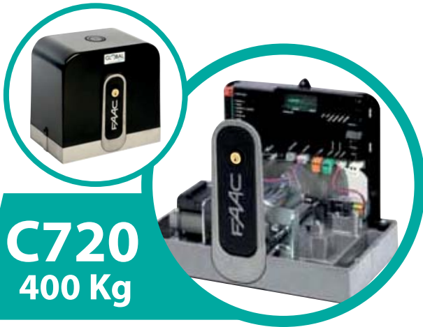
C720 400 Kg