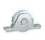
90mm frame insert gate wheel.