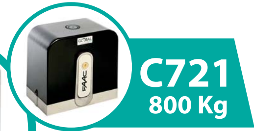
C721 800 Kg