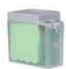
Self regulating 24V back up battery.