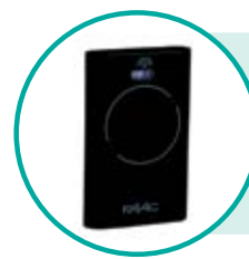
Black SLH Transmitter