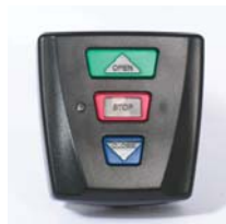
Manual Open/Stop/Close Panel