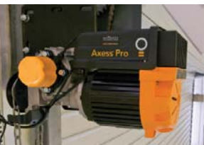
Opener with various install options