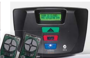
Wall Mounted Logic Controls with Safety Beams and Two TrioCode™128 transmitters